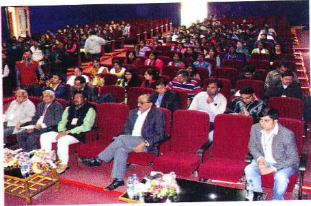
Fig.3: General view of the participants of the 20th RASI Congress, Ranchi-2015.