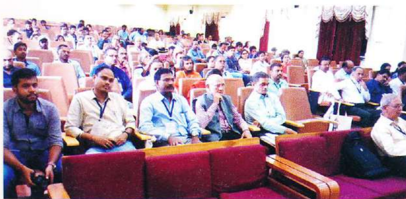
Audience in the Hall on day-1 of the RASI Congress, Pune.