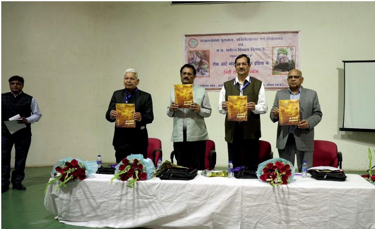
Figure 2. The guests on the dais releasing Purakala Volume 29, 2019, the journal of Rock Art Society of India.