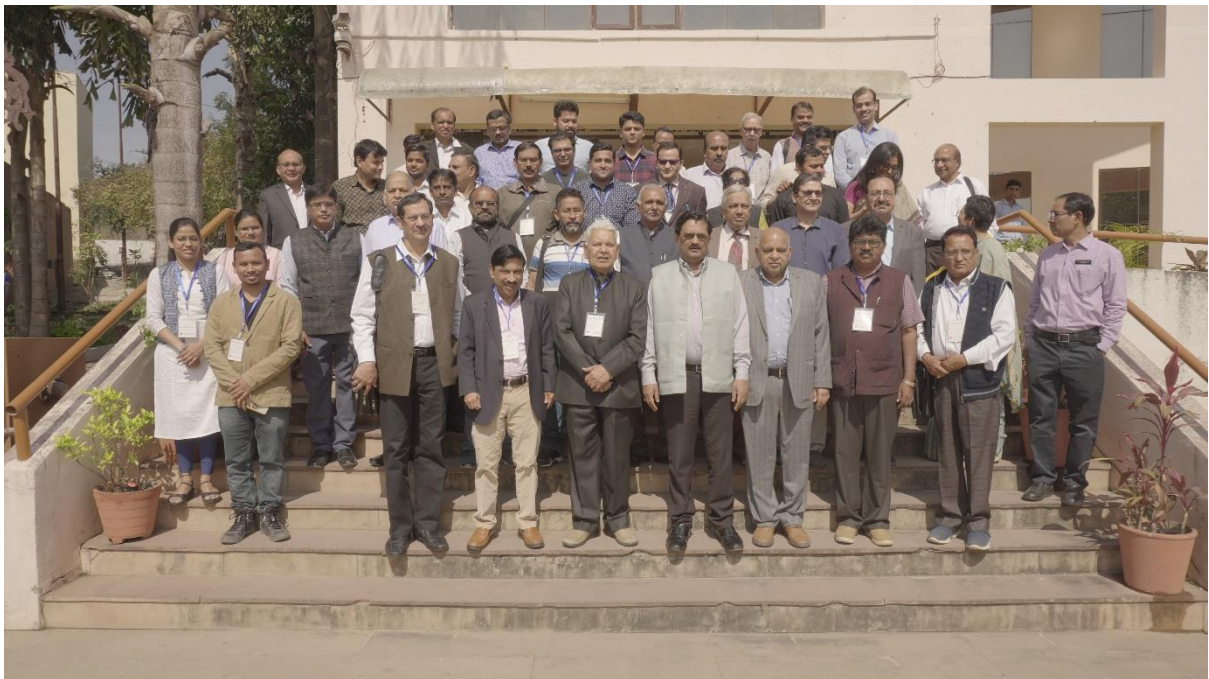
Figure 5. Group photo of the delegates of the 24 th National Conference, RASI, Bhopal.