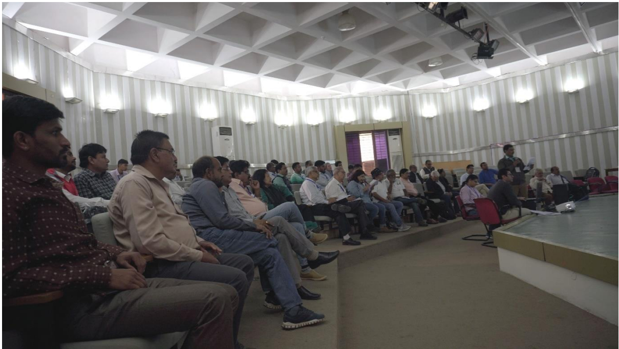
Figure 4. Audience of the 24 th national Conference of RASI, 2020 organised in the auditorium of the State Museum, Shyamla Hills, Bhopal.