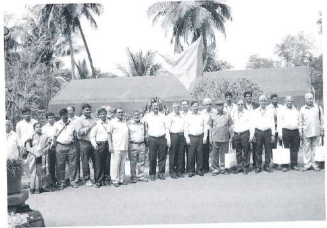
6. Group photograph of Delegates in front of the Krishi Vigyan Kendra