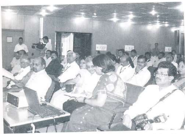
3. View of the delegates listening during inaugural function.