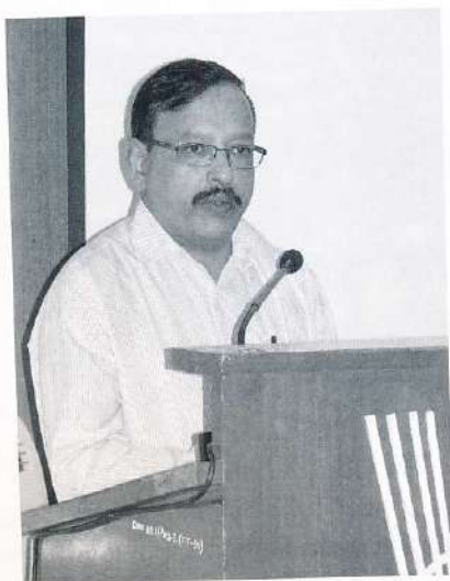
5. Chief Guest of the function Shri Pravin Srivastava addressing the delegates