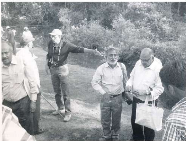
12. Delegates discussing at the Usgaimol rock art site.