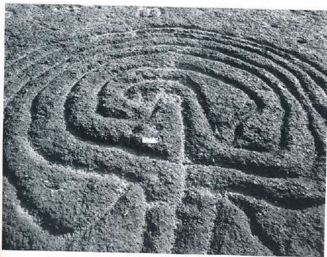
10. Deeply engraved labyrinth on laterite bed. Usgalimol, south Goa. Megalithic I.

his vision for Rock Art Discipline in India and emphasised the need for working with missionary zeal to materialise this vision. By presenting the examples of late Dr V.S. Wakankar and his own contributions, especially through the EIP Project, he emphasised that one must have adventurous and creative spirit to unfold the secrets and need dedication to accomplish the task. We have to follow evolutionary model instead of the diffusionist Eurocentric model if rock art study is to grow in a scientific discipline. He concluded that the EIP project has made India a pioneering country in the world for study of early petroglyphs and pushed back the antiquity of rock art to Lower Paleolithic which is much older than the European cave art. He