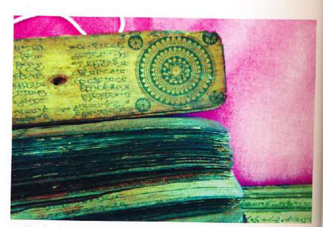
FIg. 8. Ancient manuscript on tadpatra in Kannada language housed in the library inside the temple complex.