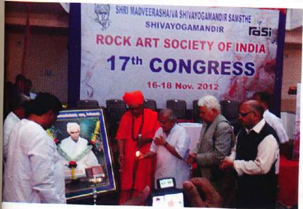
Fig. 1. Lighting a lamp by His Holiness Jagadguru Shri Sanganbasav Mahaswamiji, Shivayoga Mandir.

A photo exhibition on the monumental eritage of Karnataka was organized by the Dharward