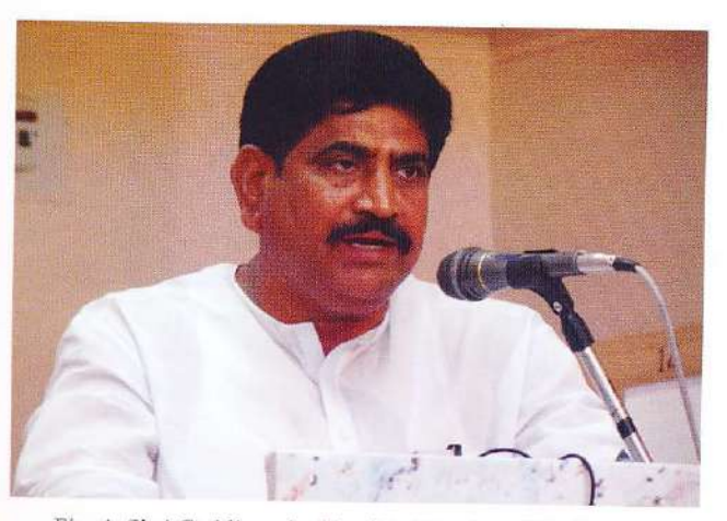
Fig. 4. Shri Gaddigoudar, Hon'ble Member of Parliament, Bagalkot delivering his speech.