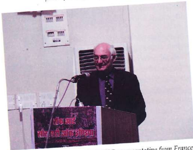
Fig.8: Prof. Jean Clottes , UNESCO representative from France delivering 18th Dr. V.S. Wakankar Memorial lecture