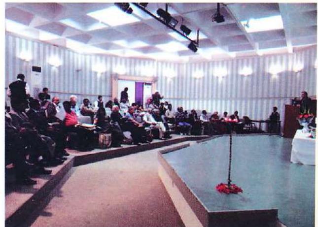
Fig.2: View of participants of Inaugural function of RASI Congress, Bhopal