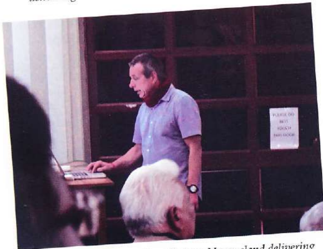
Fig.9: Dr Yann Pierre Montelle from Newzealand delivering Keynote Address of the 18th RASI Congress