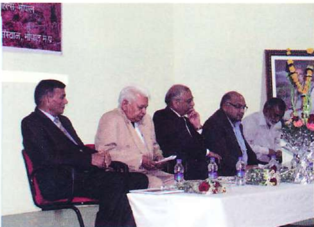
Fig.1: Dignitaries on the dais during Inaugural Function of the 18th RASI Congress