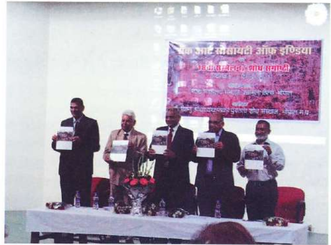
Fig.5: Release of Purakala Volume 23 by the Guests and others.

Chattan in Chambal valley and rock art and natural heritage of Pachmarhi can be the potential candidates from India.